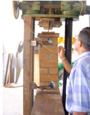
Figure 2 CSE bricks-English bond