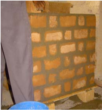
Figure 3 CSE bricks - Flemish bond