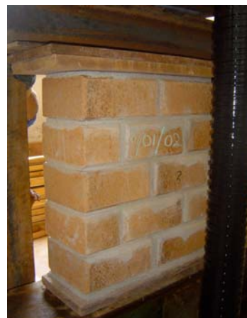
Figure 6 CSE solid plain block (235 mm thick wall)