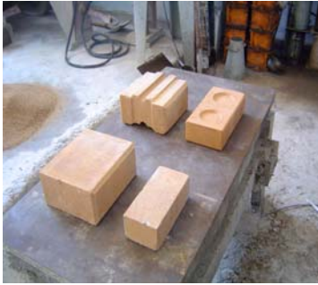
Figure 1 Block types used in the study

When thicker walls are required to carry heavier loads, solid, plain CSE blocks of 235 mm thickness can be used as an alternative to the English and Flemish bonded CSE bricks.