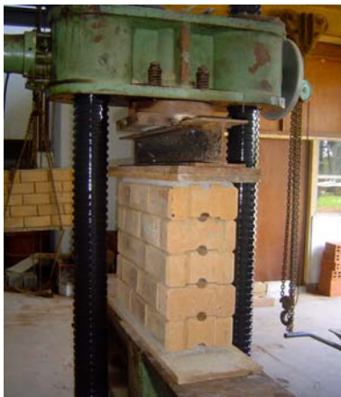
Figure 5 CSE Interlocking block panel 2 (235 mm thick wall)