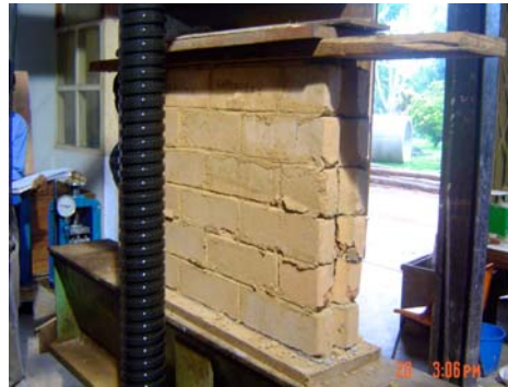
Figure 4 CSE Interlocking block panel 1- Failure pattern (145 mm thick wall)