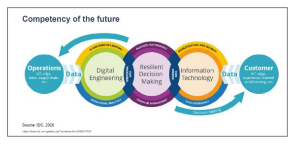
Figure 4: Competency of the future

taken with ample data/ Information technology will be playing a crucial role.