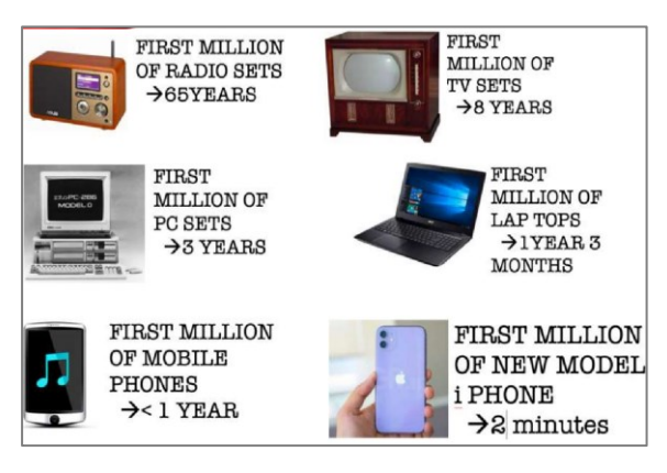
Figure 1: Technological revolution where the demand for various electronic gadgets has increased exponentially.

development in Information Technology which will benefit Mining and Geotechnical Engineers.