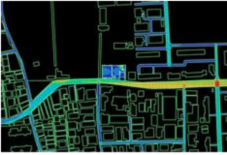
Azimpur Graveyard mosque

Figure 2, Visibility Graph Analysis of the four chosen mosques of Dhaka city.