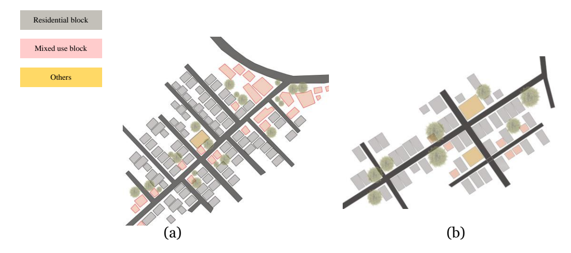
Figure 2, The left one showing the land use of Nirala (a portion) and right one showing land use of 2<sup>nd</sup> phase of Sonadanga

In most cases, the mixed-use quality evokes different types of land uses which are directly connected with the human needs and ensure active sharing within different stakeholders. From the definition about the urban form of Kevin lynch , the first studied area Nirala no.1 road , shows different land uses that have been being developed since last two or three decades. Figure 2, presents diversified functions have grown to satisfy the users. Initially, the area was developed as residential purposes which have been transforming into a mixed land use zone through time factor (Figure 2a). At neighborhood-scale, the functional diversity provides services to dwellers all day long that make the area more vibrant at a different time of the day. Particularly two major crowding develop at Nirala no.1 road; one is at early morning where people come to buy fresh vegetables which have grown at the pedestrian level. On the other hand, during late afternoon some other services, such as roadside snacks, moveable seasonal fruits have developed. Along with these, coaching, individual doctor chamber, grocery shops have generated at the ground level of the buildings that make bridge connectivity between neighborhoods to the neighborhood.