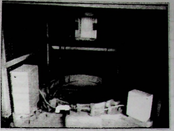
Figure 1: The Pump and the fan within an evaporative cooling unit