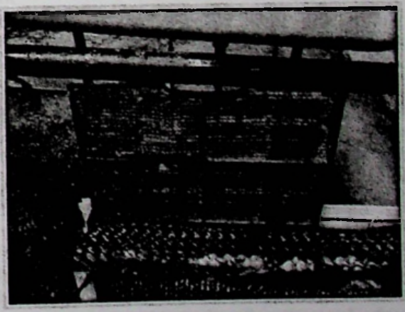
Figure 3: Air filter of an evaporative cooling unit