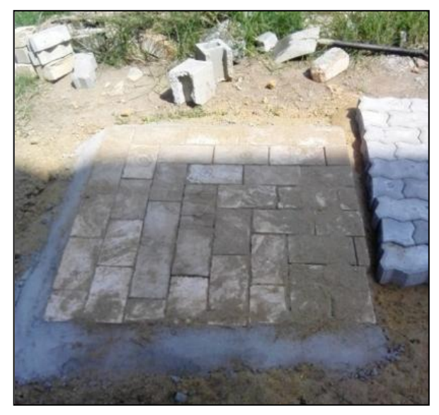
Fig. 2: Modeled paved area

A 1m x 1m square area was paved using these materials, and the paved surfaces were exposed to equal natural conditions (Fig. 2). The top and bottom surface temperatures of the different paved surfaces and surrounding air temperature were recorded for 72 hours using a data logger device (Fig. 3). From these recorded data, a 24-hour period was selected and then hourly mean temperature variances of different materials were plotted with time. The comparison is shown in Fig. 4.