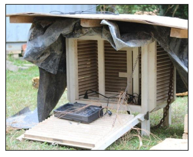
Fig. 3: Temperature data collection