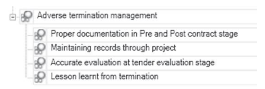
Figure 6: Coding Structure for Adverse Termination Management

Each issues regarding termination can be categorized as bellow in accordance with selected projects.