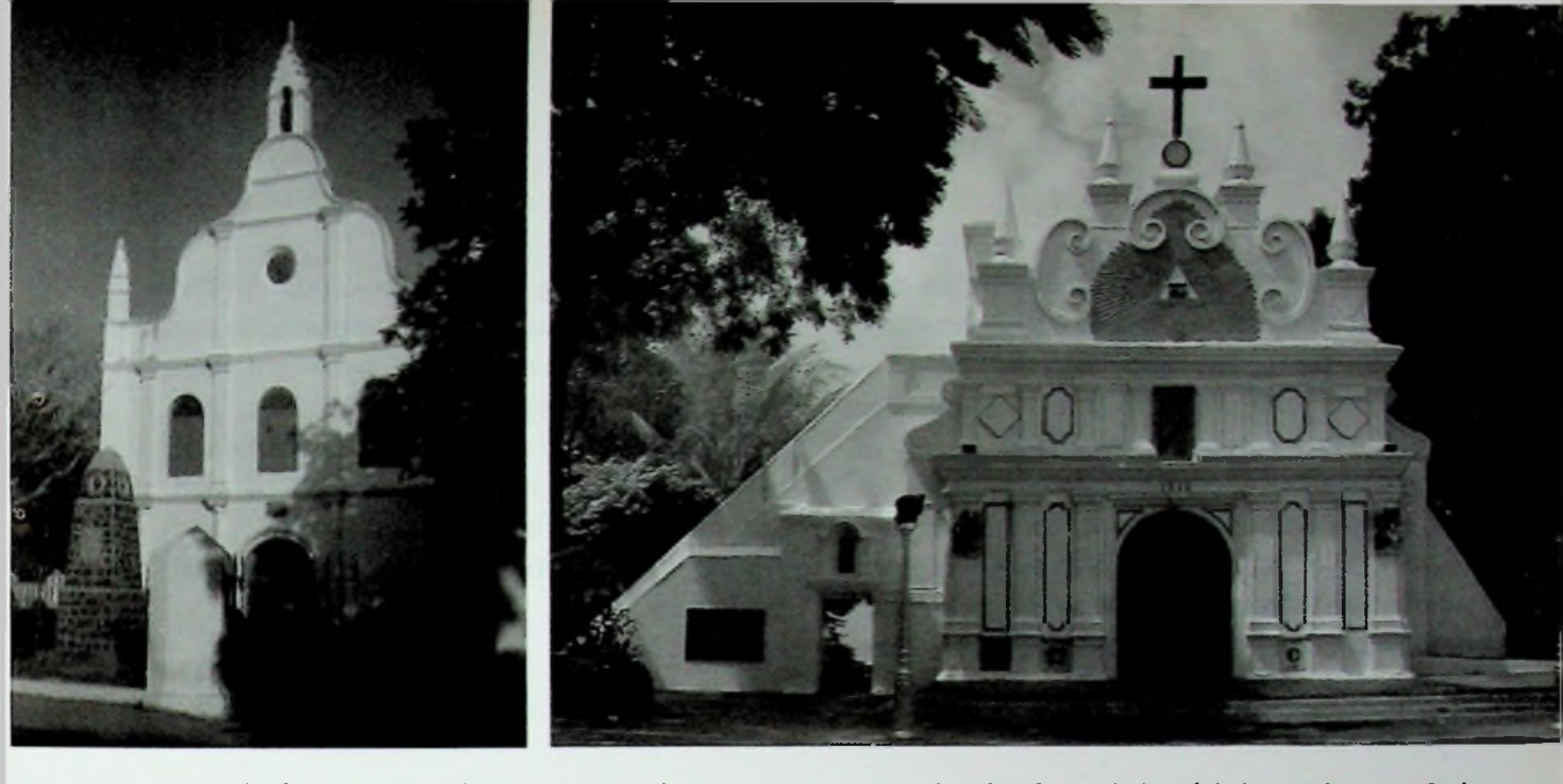
Church of St. Francis, Early Portuguese architecture