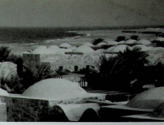
Figure 11: Domes and Vaults of the Resort

In fact this resort has always been praised for its environment friendly and sensible design, yet it had also stirred debates. Ashraf Salama believes that: "The major positive aspect in the project is that it became an exemplar of using local materials, where other projects are now utilizing same construction techniques without addition or modification. Also, it helped to create a character for a coastal desert area. However, there is a conflict between three aspects in this project, building materials and traditional construction techniques, the image and character, and the new lifestyle. Although the use of local materials contributes to the creation of a local image, it does not help to create local lifestyle, where central air conditioning systems are operated to reduce the temperature in all buildings. In fact, it is disappointing to see the grills of air exists and returns of an air conditioning system in a dome built with local materials. Thus, it can be argued that the project is superficially appealing to the local community, visitors from Egypt, and international visitors" (Salama 1999,18). While some architecture critics where expecting more from the Serena Beach al Quseir resort, others believed that its architecture is associated with Fathy's signature style, particularly the integration of the Nubian vaults and domes.