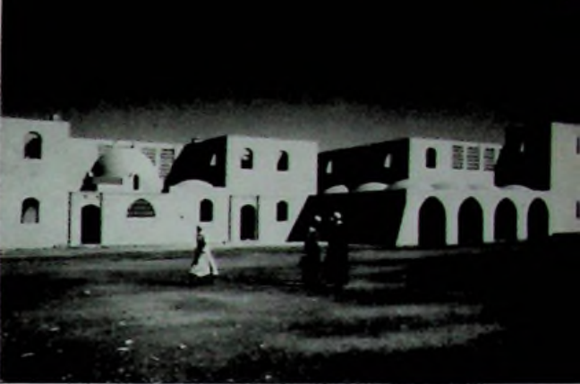
Figure 6: Public Square in New Gourna

Accordingly, it can be stated that Fathy rediscovered existing architecture in Nubian villages, where he found aesthetically