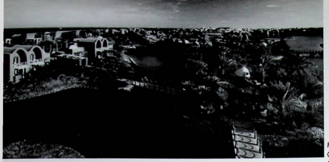
Figure 12: An Overview of el Gouna Golf Resort villas

waterfront context in an elegant manner". The resort's website states that: "The El Gouna Golf Resort is a stylish Nubian oasis of serenity and beauty within one of Egypt's most attractive holiday destination. A sensational experience complimented by stunning architecture, breathtaking landscapes, sparkling lagoons and a stay that grants pure tranquility and joy"..... "Welcome to your very own fairy-tale hotel designed by world famous architect Michael Graves. An inviting, magical mix of Arabic and Egypt's Nubian styles...."