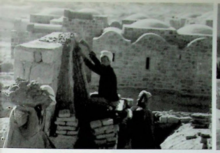
Figure 10: Building a Nubian Vault in al Quseir