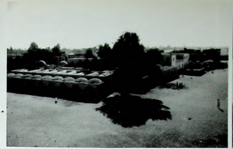
Figure 5: New Gourna Market

he was exhilarated to learn, was simple enough to teach to any willing person (ibid).