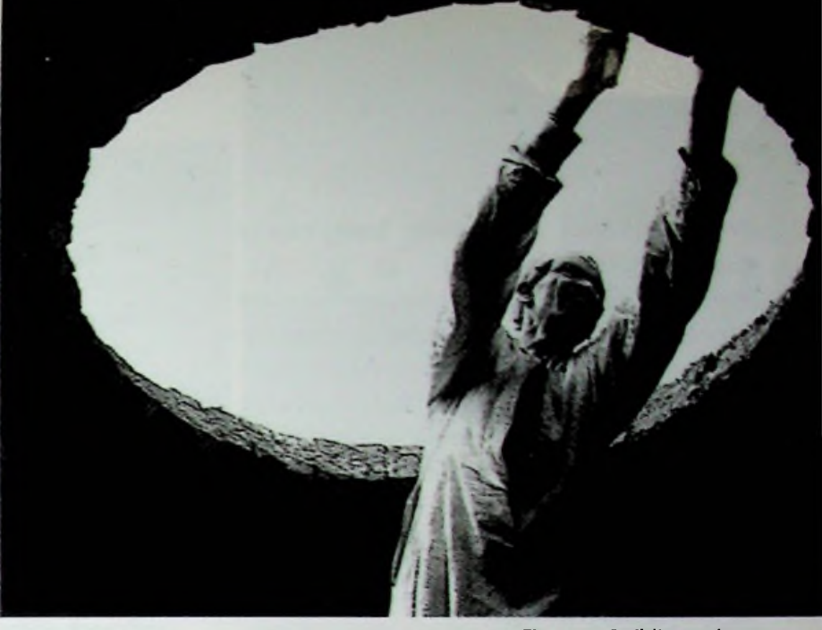
Figure 3: Building a Nubian Vault

convection or radiation from the surrounding ground. Roofs were constructed in two different ways, either using split palm trunks and acacia wood beams, with palm reed thatch and woven palm fronds covering the beams, or catenery vaults and domes.