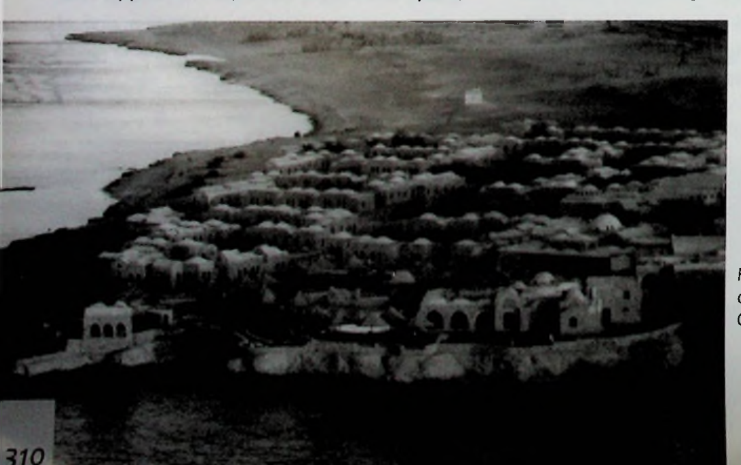
Figure 9: An Overview of Serena Beach al Quseir Resort

Designed by architects, Rami El Dahan, and Soheir Farid (Fathy's most successful disciples) in 1987. The project is 6 km north of the city of Quseir, and includes 180 rooms clustered around inner yards and connected with clear paths to the main building, cafeteria, restaurants, a health club, a gym, and a diving center. The resort complex appears to emerge from the earth because of the use of natural building materials. The stone used was quarried from the mountains behind the coastline, and the roof was made of sun-dried bricks that were produced on site. The combination was successful aesthetically and economically, and its architecture was copied in many resorts along the coastline.