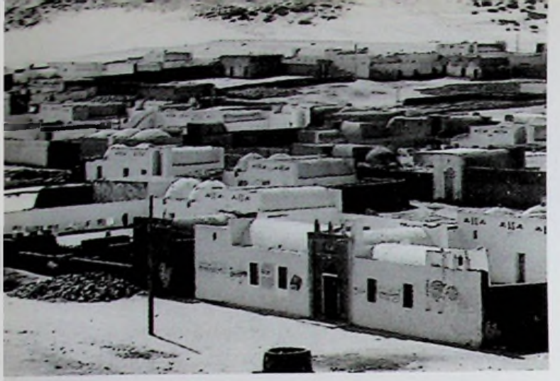
Figure1: A cluster of Nubian houses