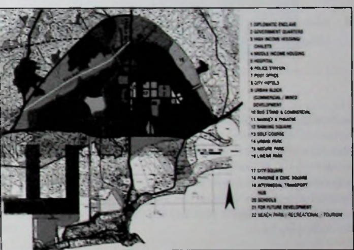
Figure 3: Development Proposals for the New City Center in Siribopura

administrative, civic functions, and certain settlements of the old town will be shifted to the new city center. Administrative functions are already shifted to the new administrative complex. The local businessmen were told that