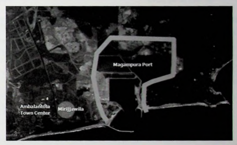
Figure 4: The Location of Mirijjawila Village, the Port Project and the Closure of CGMT Highway

Another huge impact of the port project is the closure of Colombo-Galle-Matara-Tissamaharama Highway. This particular road was the major access point to Hambantota town for those who visit Hambantota, Tissamaharama and Kataragama. During Kataragama festival season, the businesses (mainly dodol and sweets business) of the town and beach areas were very busy as Hambantota town center and beach were the stopovers of pilgrims and visitors. Presently this particular road closure has cut down the connections and it is the major reason for why the town lost its functions and activities. It is reported that 75% of the businesses of old town center is closed down due to the road closure.