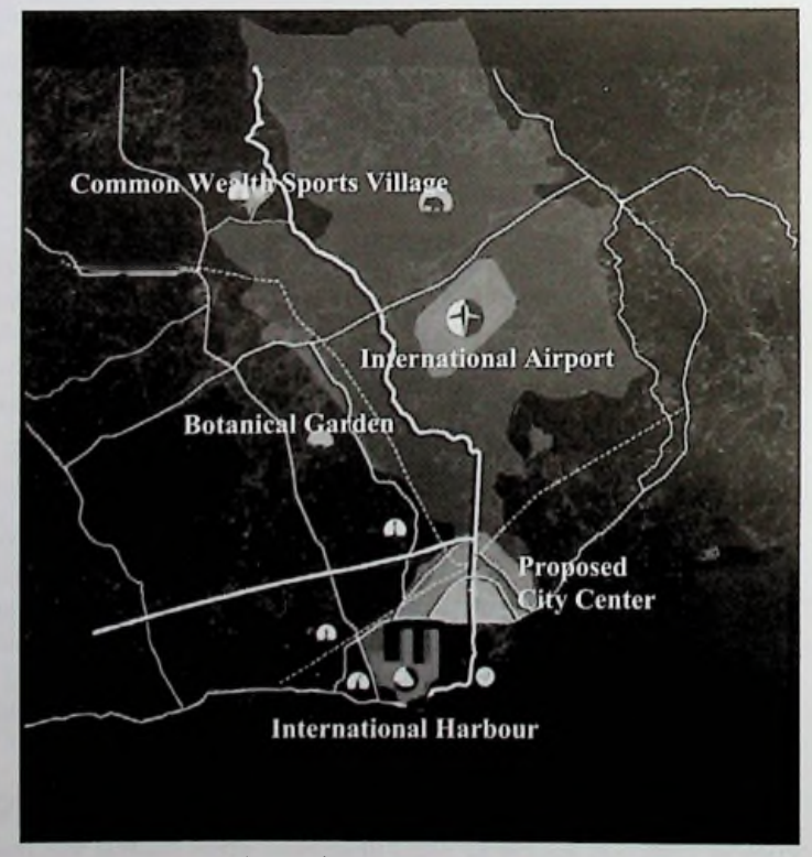
Figure 1: Major Projects of the Greater Hambantota Development Plan of Urban Development Authority.

Lanka an Emerging Wonder of Asia. This vision will be achieved through proposed five hubs such as Navigation Hub, Aviation Knowledge Hub, Hub, Energy Hub, and Commercial Hub. The National Physical Plan 2030 which was prepared by the National Physical Planning Department in year 2011 is national the level plan development that implements the goals of Mahinda Chintana political doctrine. The key proposals of the National Physical Plan 2030 are conservation of the central fragile region of the country and creation of five metro regions each with metro cities. The major goal behind the metro regions is to reduce regional disparities and to distribute population growth in a planned manner.