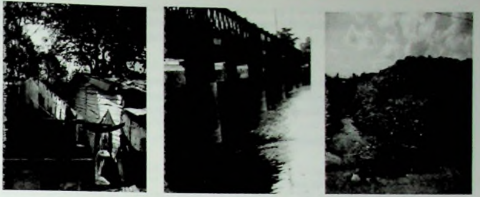
Figure 3.2: oiled mix black coloured water in Kelani River

This stretch of the Kelani River is highly polluted and water users for daily needs are suffered the most. Many of the pollution sources such as saw mills, container yards, laundries are also located within the neighbourhood. There is a huge garbage dumping site next to the settlements and the polluted canal of Kiththampahuwa too flows through this site. The existing marsh is reclaimed by people to put up houses and aggravate the floods (Figure 3.2,3 and 4).