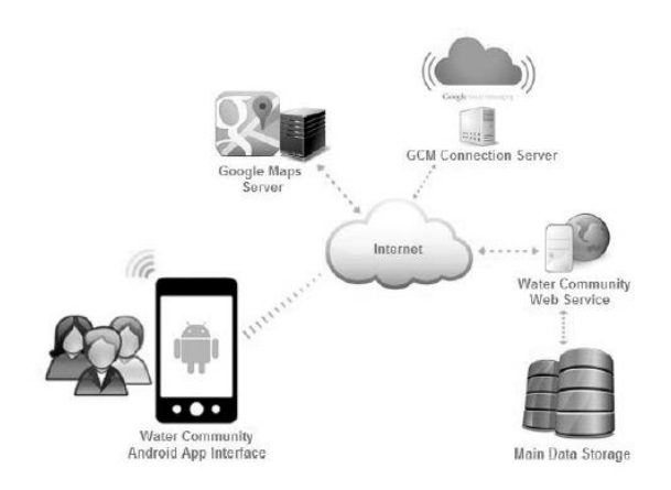
Figure.1 High Level Architecture

As previously mentioned, the major functionality of this application is to share a received complaint with details on a country's map by its location and assign a responsible member through sending a notification. Thus the application uses Google Maps service for getting the map viewing facility and Google Cloud Messaging (GCM) service for sending out a notification.