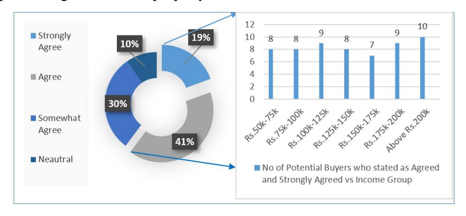
Figure 2: Relationship between the income and quick access to Colombo city before purchasing a residential property.

There is no significant relationship between income and willingness to get quick access to Colombo city. This shows all the respondents are very much need to get quick access