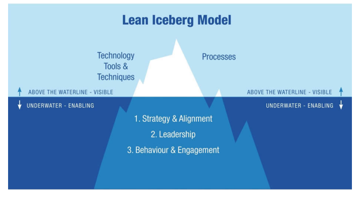
Figure 1: Lean iceberg model

Hines, et al. (2008) likened the lean transition process to the iceberg, the visible part includes technology, tools, and techniques as well as process management; the invisible part includes internal features that endorse lean and should be applied to all levels of the organization, including strategy and alignment; leadership; behaviour and engagement as present in the following Figure 1.