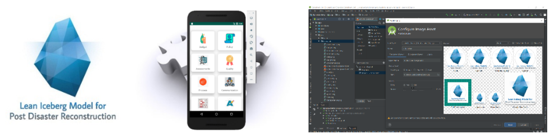
Figure 3: Developed mobile application for PDR

Based on the findings, a mobile application was developed to address the issues of PDR through LIM. This has been designed to run on android operating systems using the Android Studio version 3.5. The very first interface is a splashing activity along with an animation. Next window displays an interface showing the issues in PDR. A modern User Interface has been designed with a grid view in which the images act as buttons and navigate to the corresponding page/window. Java with sdk was used for programme coding as illustrated in Figure 3.