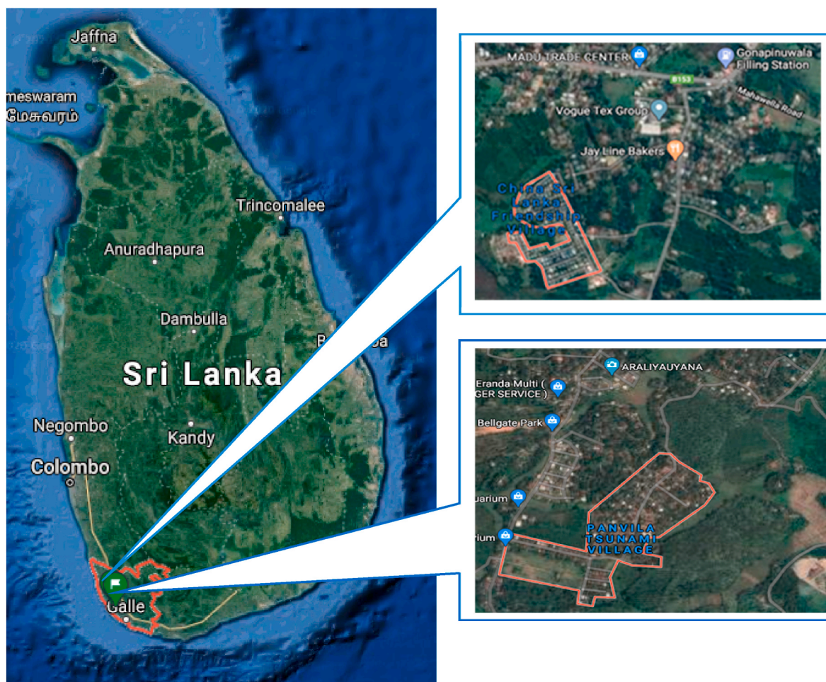
Fig. 1. Post Tsunami relocation housing schemes considered for the survey: (1) China Sri Lanka Friendship Village and (2) Panvila Tsunami Village.

scale. The standard deviations resulting for the factors varied between 0.257 and 1.435, however, all sub-factors were accepted for further analysis as SD \leq 1.25 is acceptable as well as 1.25 < SD \leq 1.49 being acceptable for marginal performance. However, only 13 (22%) out of the 58 variables belong to the marginally accepted category whereas the rest of the factors are fully accepted. The communalities presented in the Table range between 0.553 and 0.792, therefore, satisfying the sampling requirement as [60] suggests that communalities should desirably be between 0.5 or higher for adequate sampling.