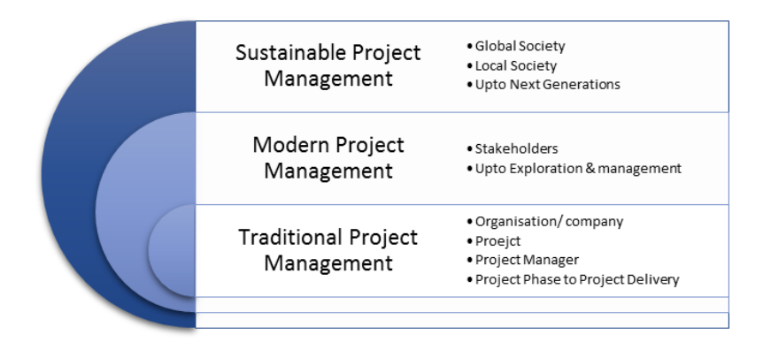
Figure 1: Expansion of sustainable project management