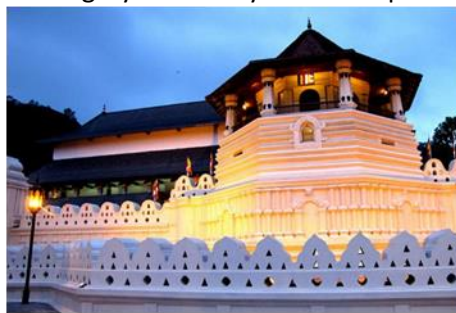
Figure 4: Temple of the Tooth