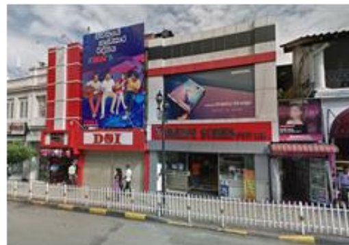
Figure: 7: Infill buildings in Dalada veediya

New construction process has different materials, details, colours, textures, and scale when compared with old buildings. When considering the present situation the scales have become unimportant matter in construction. As an example; new bank of Ceylon building is constructed with new material such as; wall tile, glass and aluminium. Detailing is closed to British style. By installing a Kandyan roof, designer has tried to give a Kandyan character to the building. But only the Kandyan roof alone can't crate that unique style. It is about composition, proportions and combinations of other all factors.