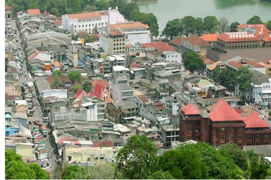
Figure 2: Historic living City of Kandy; (Source: https://www.google.com )

Infill architecture is also one important section of new architecture in a historic city. Infill buildings are always situated in between historic buildings or objects. In historic cities, there is a public interest beyond that of client or architectural inventiveness. No developer or architect has the right to destroy the quality of an ancient street or the setting of an historical building. Doing opposite is not always infill architecture in a historic setting, but it could be a revival of a previous architectural style. There have been times in the past when it was fashionable to use historical styles to generate the design of infill buildings. When designing new development in a historic setting, guidelines can be considered as a key technique. However the final result should be that infill design should be respond to its existing historical context.