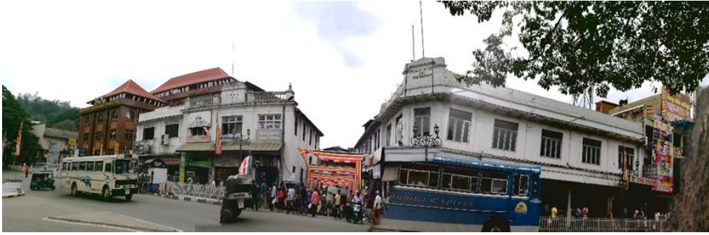
Figure: 8: Panorama view of Infill buildings in Dalada veediya