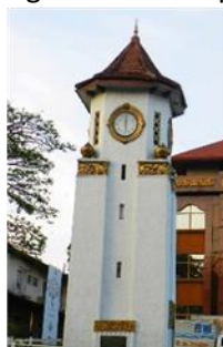
Figure 3: Clock Tower

When considering the tangible context of Kandy city, very important and significant object buildings are identified scattered all over the city. These buildings are very different to each other by their architectural style and function too. There are various type of buildings in Kandy city, such as; religious temples, churches, mosque, land mark, old post office, Sylvester collage etc. The most significant and spiritual imagery of the city is the temple of tooth.