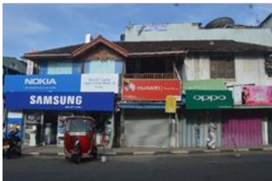
Figure: 6: Infill buildings in Kandy

Kandy is full of different types of architectural styles. All these express unique character of that period. But those are respected to past while maintaining historical layers of development process. But the new construction process violates the old architectural style without responding to the context. It directly affects the total image of the city.