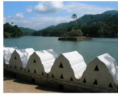
Figure 5: Tank in Kandy