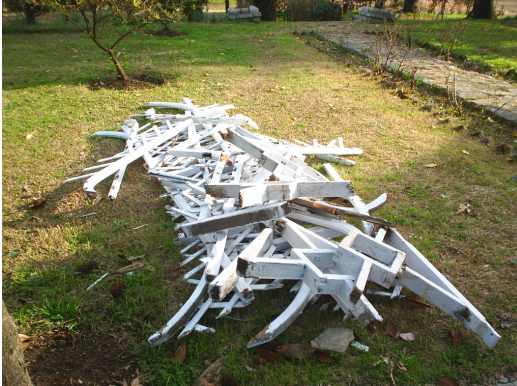
Fig. 15 & 16: Frontier House Back Side View and damaged wooden handrail