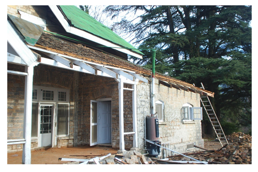
Fig. 4: Frontier House Back Side View

The next crucial step in conservation was to open the roof in order to identify the voids which later on might be become a serious problem in storm water management. In frontier house the access were difficult to roof due to very worse condition of the roof because of dampness in wooden materials as the structure is surrounded by heavy tall trees around the buildings. The roof was repaired in its original condition through the help of expertise. (Figure. 4)