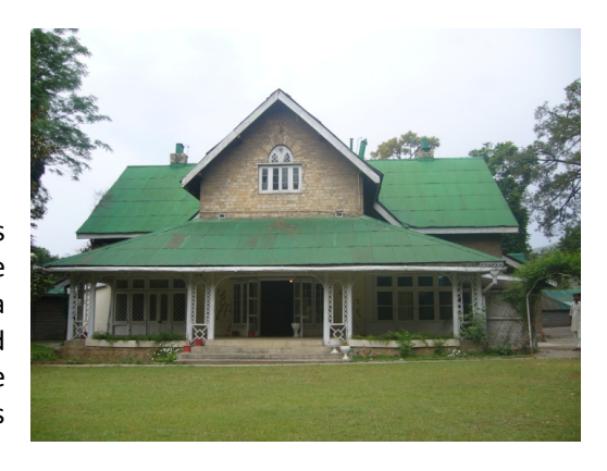
Fig. 1: Frontier House Abbottabad

Frontier House and commissioner House was among top priority in the list of built heritage to be conserved after the great earthquake 2005, As a result of prilimery visual survey, lot of cracks and material decay were identified, and Frontier house and commissioner house are the unique examples of British Era Architecture. (Figure. 1 & 2)