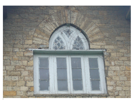
Fig. 7: Frontier House Window

For proper investigation of built heritage which is at stake, we were supposed to remove the herbs/sherbs on the walls and on its roof very carefully according to the experts' opinions and advice. While removing the finishing from the walls, proper consideration needs to be taken. In given figure (7) the window shown was completely damaged and due to the vegetation on the wall surface, unnecessary plants were removed from the whole building to clean and secured from the further seepage and keep the originality of the buildings maintained. (Figure. 7)