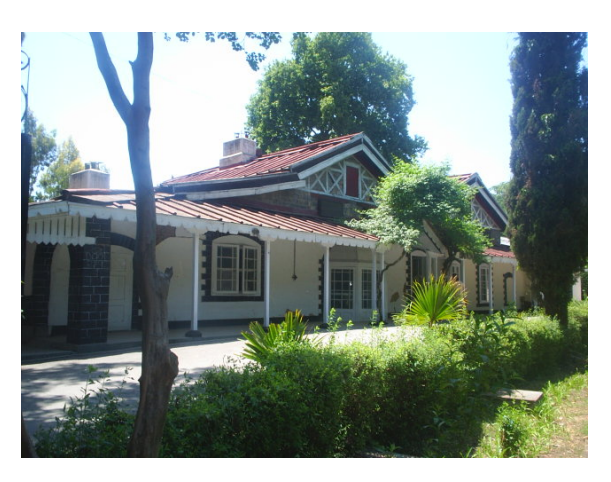
Fig. 2: Commissioner House Abbottabad

It is important to trace back the history of these two prominent buildings and it could be only possible by producing the historical documents and maps. It would be convenient for the expertise like Architects and Archeologists to carry out the initial damage and then to sort out the practical approach for the conservation of two significant built heritage. Before undergone through this exercise, its utmost important to understand its original identity through its materials, construction techniques, form and spaces. The historical research enable us how to bring back the earthquake affected heritage into its original identity. For this we undergone through the study of old documents and historical background of buildings to make possible solutions.