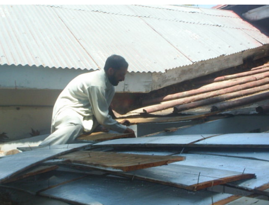
Fig. 5: Commissioner House Roof Inside