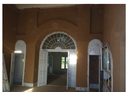
Fig. 12, 13 & 14: Frontier House Inside and Outside View during and after work.