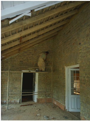
Fig. 10 & 11: Commissioner House Front and Back Entrance.