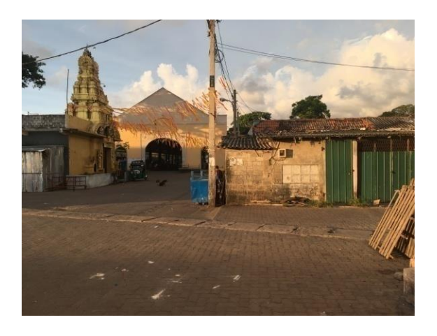
Fig 2: Kamachchodai Pola on a dull day

The research was commenced with a pilot study that was carried out on a week day between the times between 5.30 p.m. to 6.30 p.m. The Kamachchodai Pola /market was identified to be not busy serving its usual purpose but instead other activities like leisure gathering of the family and children playing were observedat such times. This observation represented the contrasting image from a bustling busy day where the Pola (local market/fair) seems to turn into a "carnival" of its own (refer to figure 2 & figure 3). Mora Wala was similarly observed and thus was identified as a place with many unique landscape characteristics that attracted many people creating a particular identity in the area. Further, it was found that the place has been used for leisure activities since olden ages to this date by not only the locals but by outsiders as well.