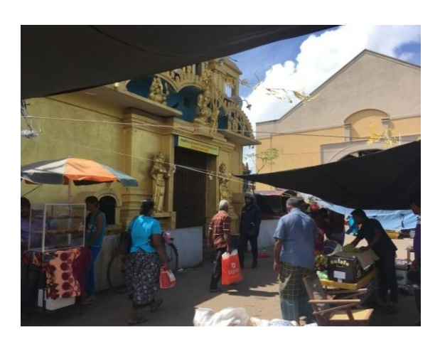
Fig 3: Kamachchodai Pola on a busy day

The pilot study consist a photographic survey that allowed capturing the surrounding situation at the moment and which paves the way for a better analysis. The field study observed the day to day activities of the community of the selected settlement areas; Kamachchodai Pola and Mora Wala . Subsequently according to the outcomes of the pilot study, a suitable questionnaire was formed for the case study. Yet due to the identified issues faced in obtaining answers through writing during the pilot study due to the literacy level of the community, leading most of them to refrain from even trying to answer stating that "they've not learned well enough to write for such things", it was converted into the format of a casual interview with the userswhich followed the outlined structure of the questionnaire prepared. It was realized at that moment that casual interviewswould be the key to open up a more effective conversation with most of the people at site. It also exposed their attitude in being very helpful once you've earned their trust and confidence. It further highlighted the fact that if they are attached to any place, it definitely will be built up on a solid reason or a more sensitive one.