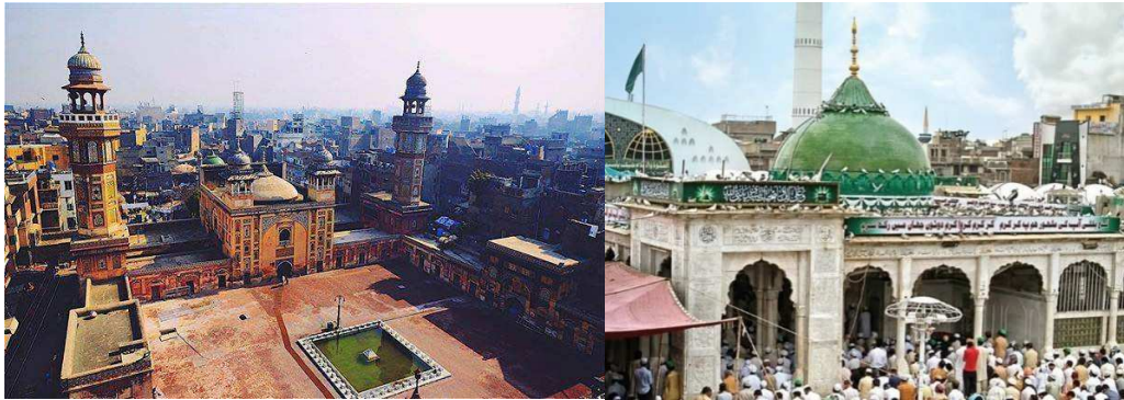
Fig. 3: Left Hand: Ariel view of Mosque wazir khan, Right hand: Data Darbar

Along with Islamic religious structure Lahore also has many churches, gurdawaras and temples. These all form a mystic layer and make city of Lahore religiously rich.