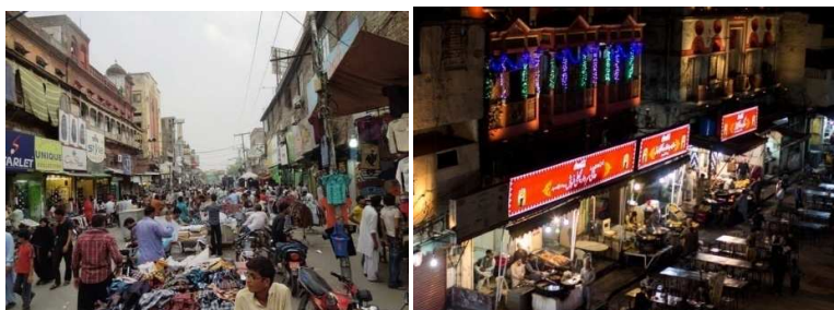
Fig. 1: Left Hand: Famous Anarkali bazar,Lahore, Right hand: Food street Gawalmandi

Lahore is a visually stunning because of Mughal architecture, surrounded by bustling and crowded bazaars with history floating through every corner of the city, it is a combination of tradition and passion weaved together. It is said that “Lahore has its feet in history and its heart and soul in food.”