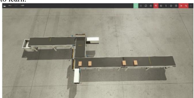
Fig 3: Simulation of 'Palletizer' in Factory IO

Hardware components needed for the lab setup were identified using the results of the simulation. Figure 3 shows an instant of the simulation of the given scenario in operation. Table 1 shows the hardware specifications of those components. Moreover, this simulation of the 'Palletizer' is added to the web page, as a reference simulation for students to learn.