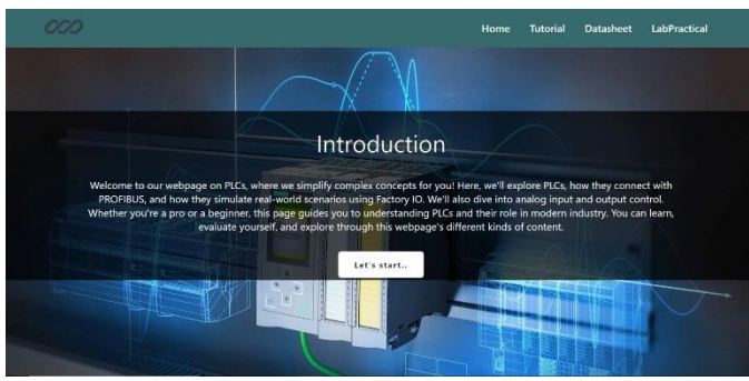
Fig 4: User interface of the web interface

The homepage of the web interface is shown in Figure 4. To achieve earlier goals, three sections; 'tutorial', 'datasheets' and 'lab practical' are included to the web interface. As future work, UX (User experience) assessment based on user testing must be followed as the last step of design flow.