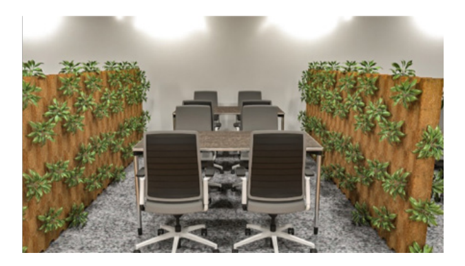
Figure 10: The Biophilic modular set up installation within interior space with 3D illustrations