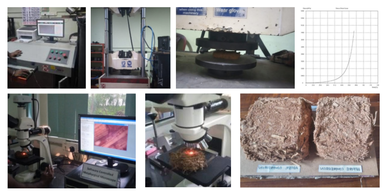
Figure 3: Conducted composite material LAB testing process

As the second stage of the material development process, developed composite material samples have tested with LAB testing and domestic testing to check the material gained qualities and to identify the material applicability's for a product manufacturing outcome.