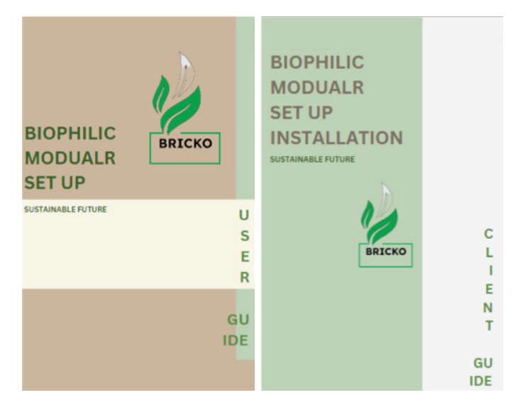
Figure 7: Customer instruction provided leaflet for the modular unit installation

Within the provided plantation grow interior plants which are mentioned in the instruction guides.