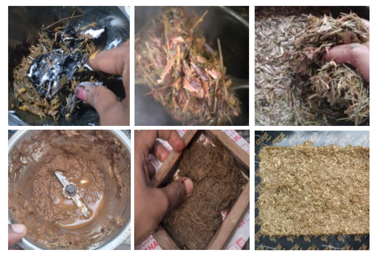
Figure 1: Composite material processing

The first phase of the project was the material development stage. Initially started with identifying the raw material qualities with simple domestic testing and conducted parallel studies of the existing literature related to the project while developing the material pieces.