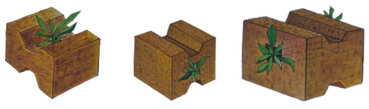
Figure 8: Biophilic modular units with customizable planting spaces

Figure 7: Customer instruction provided leaflet for the modular unit installation