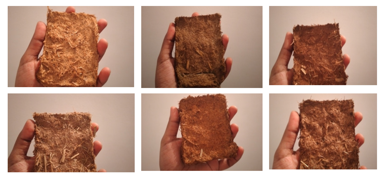
Figure 2: Dried out composite sample pieces