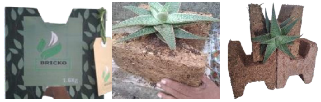
Figure 6: Modular unit installation

Within the provided plantation grow interior plants which are mentioned in the instruction guides.