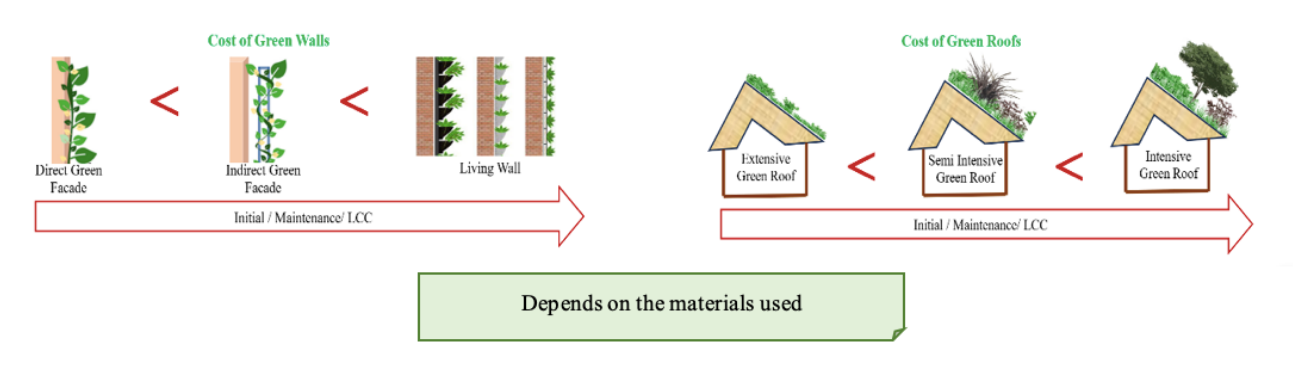
Figure 3: Cost of Green Walls and Green Roofs Constructions

Both these concepts of green walls and green roofs address most of the pressing challenges in the current society. Since Sri Lanka is a tropical-climactic country, adopting these greenery concepts is not much challenging. The green wall and green roof concepts are rapidly spreading in the global context. However, those greenery applications are in their infancy in Sri Lanka.