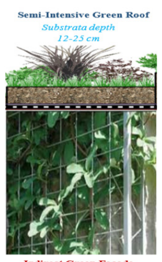
Indirect Green Facade Climbing plant supported with structures such as steel cables or trellis