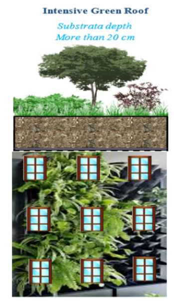
Living Walls Prefabricated or prevegetated systems on a modular panel that contains growing media with balanced nutrients

Figure 1: Green Wall and Green Roof Classification