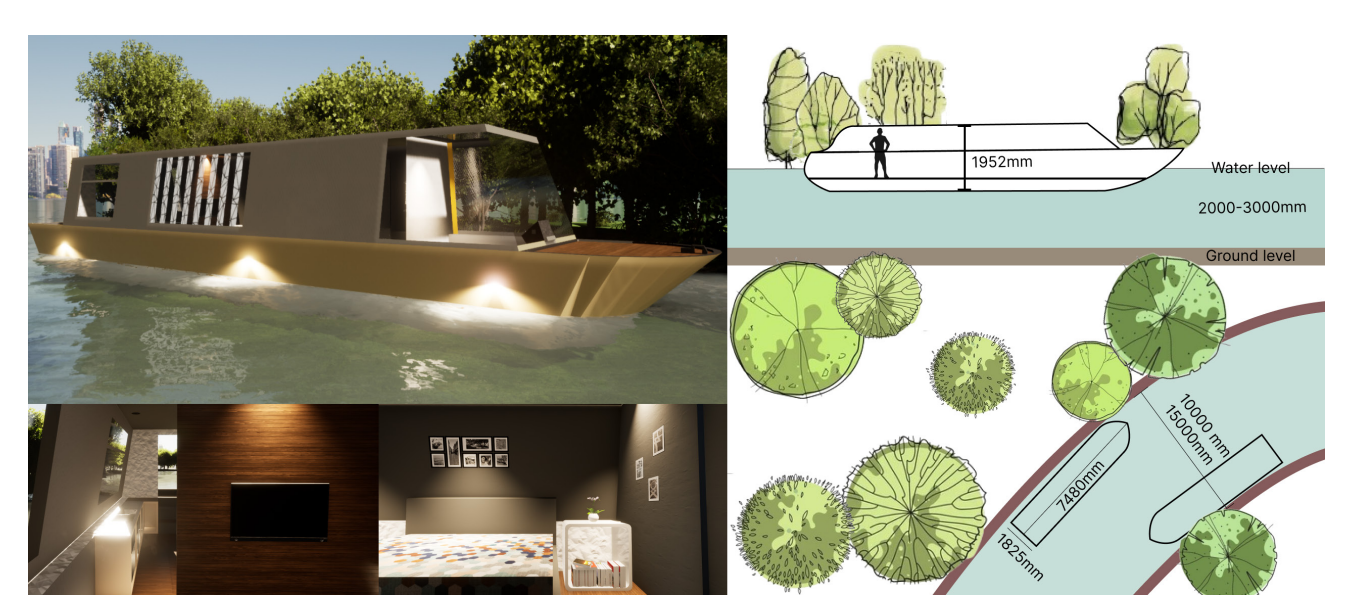
Figure 2: Boat Details

enables solar-powered self-charging, fostering long-term ecosystem health and sustainability. Two versions of the boat, the "Serene Voyager," will be available: one with a single bedroom and another with two bedrooms, designed to accommodate individuals, couples, and families of varying sizes. The interior of each boat combines