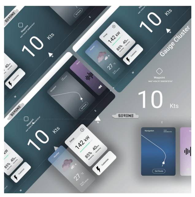
Figure 3: Digital Gauge Cluster Interface

elegance and comfort, with thoughtfully planned spaces that maximize both functionality and style. Each vessel is equipped with a kitchen, bathroom, and multiple chambers, all created to enhance the visitor's experience of tranquility and luxury on the water. The lobby space, designed with a panoramic view, serves as a comfortable lounging area