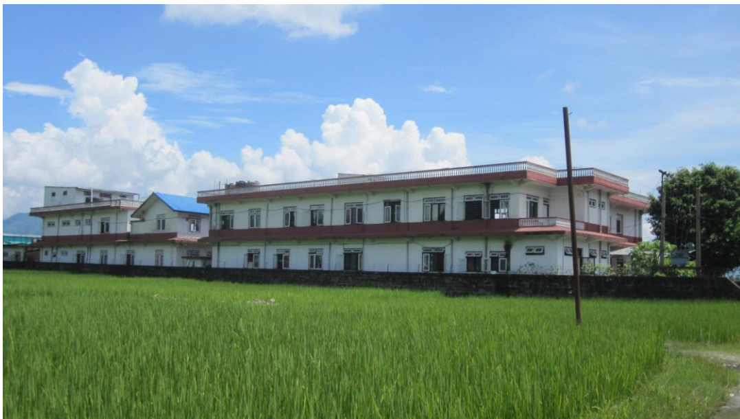
Figure 1: Jyoti Vocational Training Centre

Engineers Without Borders' Australian Chapter was formed in 2002 by a group of engineering students from Melbourne who wanted to use their skills to create lasting change through development work. The group noticed a gap in the development engineering sector – while experienced engineers were sought after for complex projects, there was a lack of opportunity for many (particularly young) engineers to become involved in grassroots humanitarian engineering. The group decided Australia needed a framework through which many more engineers, students and engineering companies could become involved in meaningful community development. Such an organisation would be more than just an overseas placement network - it would be a community of like-minded people who were inspired to learn about the issues facing the world and were prepared to strive to improve the living conditions of disadvantaged people [6].