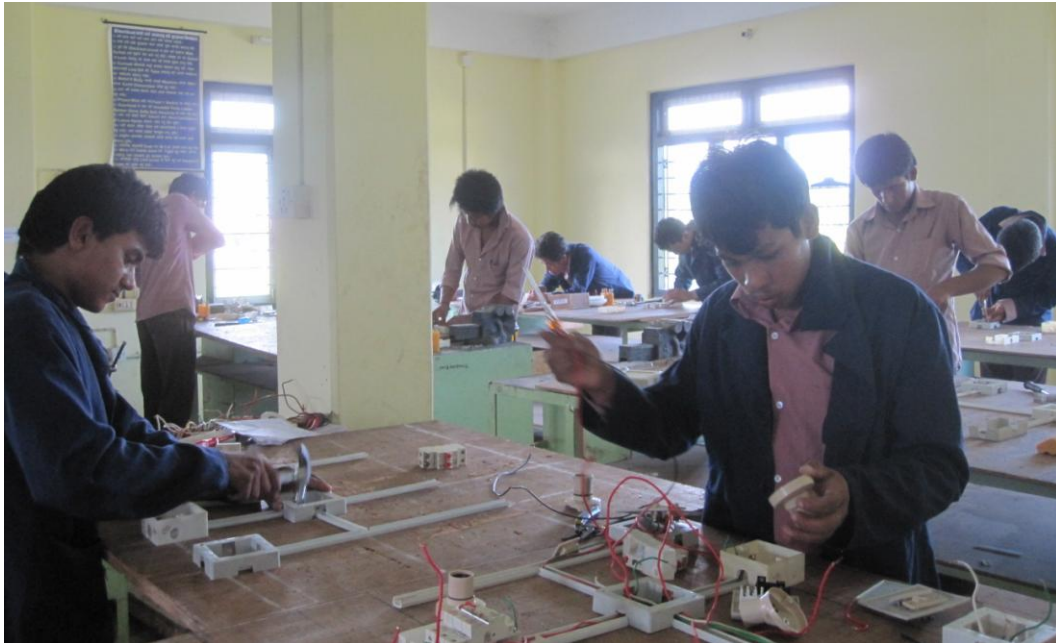
Figure 2: JVTC trainees completing a practical class in the electrical workshop

Beyond the role of a traditional training centre, JVTC also offers psycho-social support and counselling, residential services, health education and career guidance to trainees. Through this holistic approach it is hoped the trainees, almost a third of whom come to JVTC suffering from childhood trauma, can be empowered not just to find work but to constructively reintegrate into society.