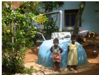
Fig. 5: Partial under ground tank