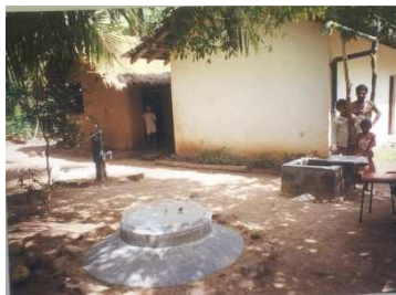
Fig. 4: Under ground tank