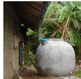
Fig. 6: Above ground Ferro cement tank

Rain water harvesting system tanks can be placed above ground, underground (Figure 4-6) or partially underground.