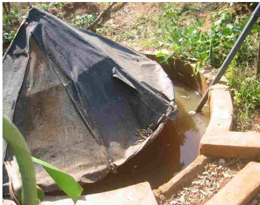
Fig. 1: Run off tank at Kurundamkulama

If the run-off water is stored in the land itself, it would be available to plants when there is a water shortage. In some parts of the dry zone, small ponds called "Pathahas" have been used to collect and store rain water. Such a water collecting system on farm would enable farmers to cultivate crops during the dry seasons.