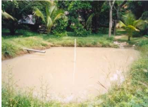
Fig. 2: "Pathaha" at Nikaweratiya

Water lost from the ground by way of evaporation, tube wells etc, needs to be replenished. Collecting rain water in ponds and pools in a manner where water percolates in to the ground raises the water table. A study conducted in Nikaweratiya on the use of pathahas (Figure 2) (Shanthi de Silva, 2005), shows that these elevate the ground water level, thus increasing the quantity of water available for both domestic and agricultural use even during the dry season.